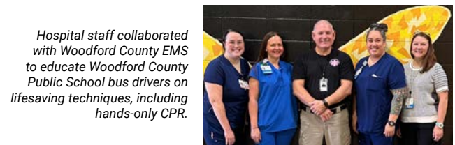
Hospital staff collaborated with Woodford County EMS to educate Woodford County Public School bus drivers on lifesaving techniques, including hands-only CPR.