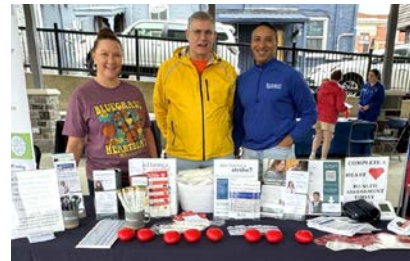
Centerpoint Health – Versailles participated in the annual Twilight Festival in downtown Versailles as the Health & Wellness sponsor.