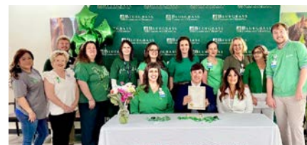
The hospital hosted community leaders to declare May as Mental Health Awareness Month in Woodford County.